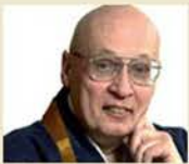
Nonin Global Moderator

Posts: 3551 Joined: Wed Feb 04, 2009 3:30 pm Location: Omaha, Nebraska, USA antispam: No