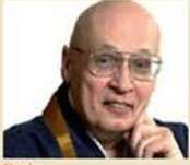
Nonin Global Moderator

Posts: 3548 Joined: Wed Feb 04, 2009 3:30 pm Location: Omaha, Nebraska, USA antispam: No