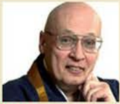
Nonin Global Moderator

Posts: 3545 Joined: Wed Feb 04, 2009 3:30 pm Location: Omaha, Nebraska, USA antispam: No