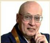
Nonin Global Moderator

Posts: 3554 Joined: Wed Feb 04, 2009 3:30 pm Location: Omaha, Nebraska, USA antispam: No