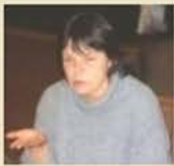
Carol Global Moderator

1937 posts • Page 97 of 97 • 1 ... 93 94 95 96 97