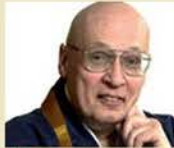
Nonin Global Moderator

Believe Genjo's formal connection with ZSS is severed.