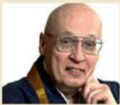
Nonin Global Moderator

One very small, but quite telling, example of the ZSS approach to what has been dubbed "transparency" is the fact that the recommendations made by the Faith Trust Institute might never have seen the light of day if the Rev. Kobutsu Malone -- a man standing outside the 'caring' confines of ZSS -- had not ferreted them out.