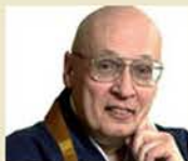
Nonin Global Moderator

Posts: 3545 Joined: Wed Feb 04, 2009 3:30 pm Location: Omaha, Nebraska, USA antispam: No