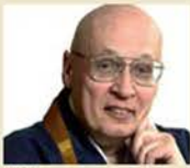
Nonin Global Moderator

Posts: 3562 Joined: Wed Feb 04, 2009 3:30 pm Location: Omaha, Nebraska, USA antispam: No