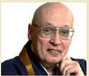
Nonin Global Moderator

Posts: 3544 Joined: Wed Feb 04, 2009 3:30 pm Location: Omaha, Nebraska, USA antispam: No