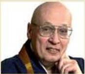
Nonin Global Moderator

What is nearness if it fails to come about despite the reduction of the longest intervals? What is nearness if it is even repelled by the restless abolition of distances? What is nearness if remoteness also remains absent? -Martin Heidegger