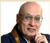
Nonin Global Moderator

Posts: 3562 Joined: Wed Feb 04, 2009 3:30 pm Location: Omaha, Nebraska, USA antispam: No