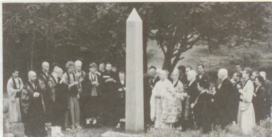
Roshi and sesshin participants dedicating the new stupa in Sangha Meadow.

7:15 Coffee and tea in dining room 7:30 Bus and day guests depart