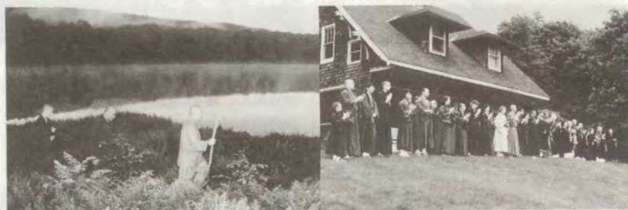
Circumambulating Beecher Lake.