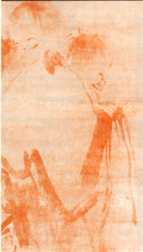
"Han-shan and Shih-te" by Liang K'ai. Southern Sung Dynasty

with Special Performance of Classical Baroque Music