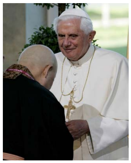
Shimano greets Pope Benedict XVI at an April 2008 interreligious gathering in Washington, D.C.

"Regardless of what it's called," Robin Westen told me, "it's a cult. You go away, you sleep maybe five hours a night, you're eating three bowls of rice on your knees, there's no talking, you're sitting on a cushion until your knees are killing you for 12 fucking hours a day. You're waking up at four in the morning and chanting, and the only person you can talk to is this dude in a little closet of a room. They're breaking you down."