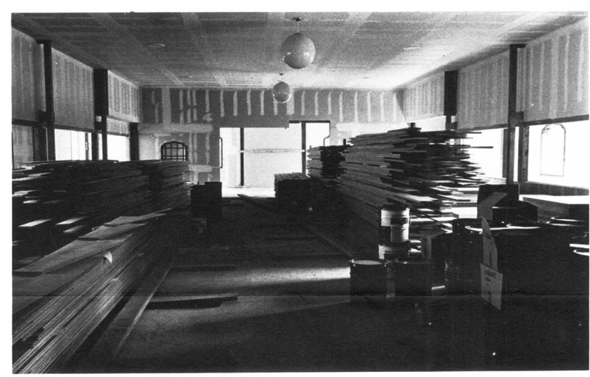
Interior of Zendo, Spring, 1975